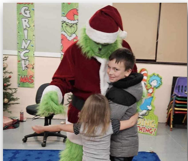
The Clarks Public Library celebrated Merry Grinchmas December 22. We read “How the Grinch Lost Christmas”. While reading the story, there was a special delivery made and the Grinch himself popped out of the big present. Everyone was surprised! The library served cookies, hot cocoa, and wassail for all who attended. Everyone got to take home a Dr. Seuss cup, a Grinch sticker and candy cane. It was a fun afternoon with the Grinch!