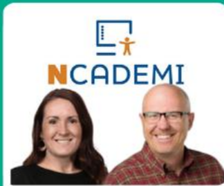
The NCADEMI Team Topic: WCAG Accessibility