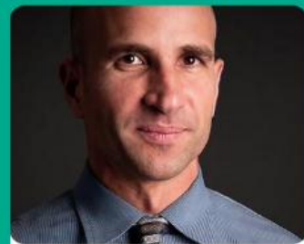
Tony Frontier Topic: AI with Intention