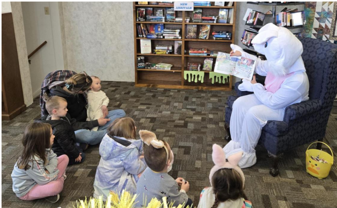
The Easter Bunny visits Valparaiso Public Library. (More on page 4.)