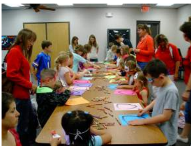
Lied Pierce Public Library Summer readers made their own super hero shields.