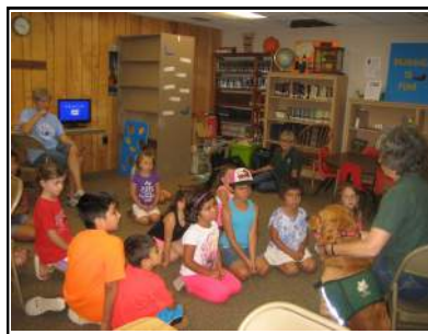
Kids at the Dakota City Library learned about animal heroes during an SRP event.