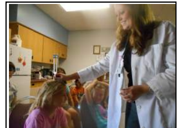
Kids with the Newman Grove Public Library SRP learned about every day super heroes at the local doctor's office.