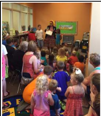
Bloomfield Public Library helped celebrate the town's Q125 with a clown show!