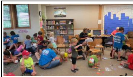
Wayne Public Library celebrated Wayne Chicken Days Henoween with 50+ kids at the library making chicken lanterns.