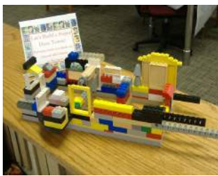
Pilger Public Library's readers helped construct a Lego super hero tower that grew by the number of books they checked out.