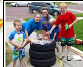
Randolph Public Library SRP participants completed super hero training.