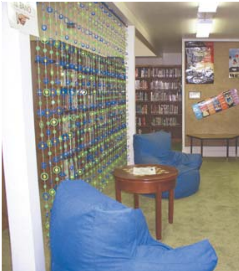
Schuyler Public Library's New 'Teen Zone'.