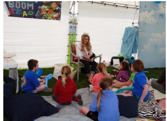
Miss Nebraska visited the Wayne Public Library.