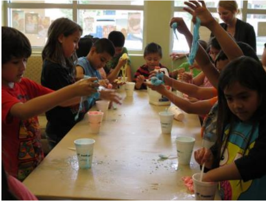
Kids at the Madison Public Library made some slime during their Summer Reading Program